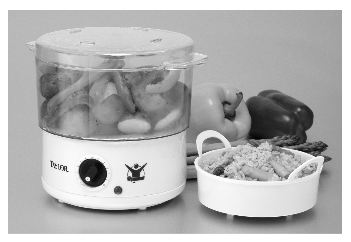
Item # AS-1550-BL 120V ~ 60Hz 400W